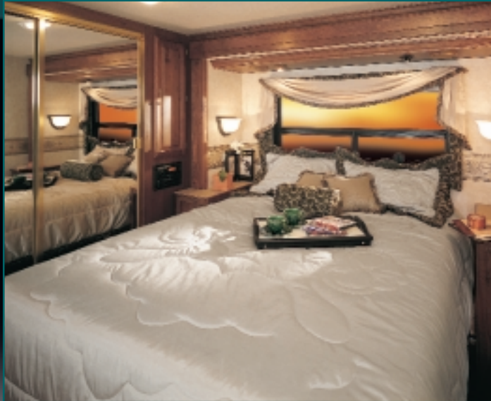
An interior designer's dream—Discovery's bedroom combines the warmth of optional walnut cabinets with custom fabrics and window treatments for that extra touch of elegance.