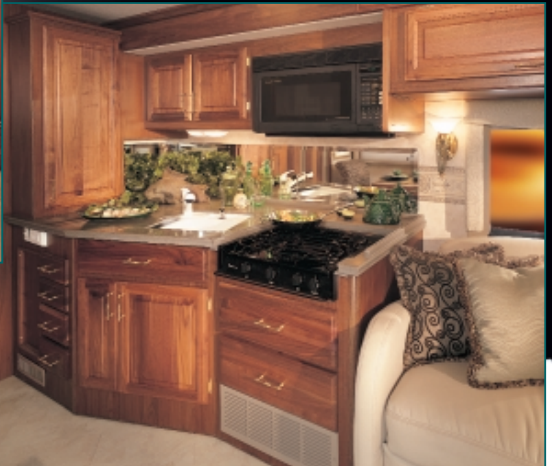
Cooking in Discovery is a five-star dream come true, with a galley that features a three-burner stove, GE® convection microwave, 12-cu. ft. side-by-side Dometic® refrigerator, porcelain sink and solid surface countertops.

But perhaps it is in the details where Discovery really makes an impact. It's loaded with premium appliances from companies you trust such as Panasonic®, Dometic® and Magic Chef® to name a few. The galley features laminated tile flooring and solid surface countertops. A new retractable spray head galley faucet, three-burner high-output cooktop, convection microwave plus an optional central vacuum system all complement your lifestyle and activities.