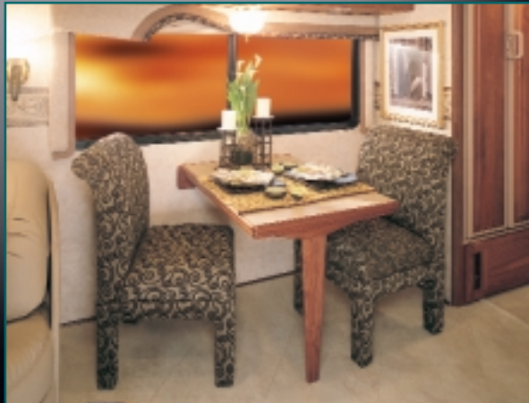
The dining area features a beautifully designed table with free-standing custom-upholstered chairs.