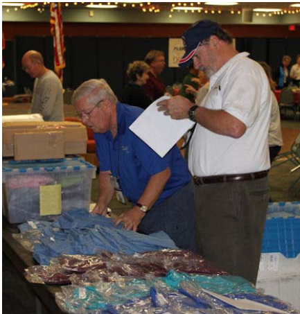
Dick Tracy and Bruce Bruce worked on merchandise.