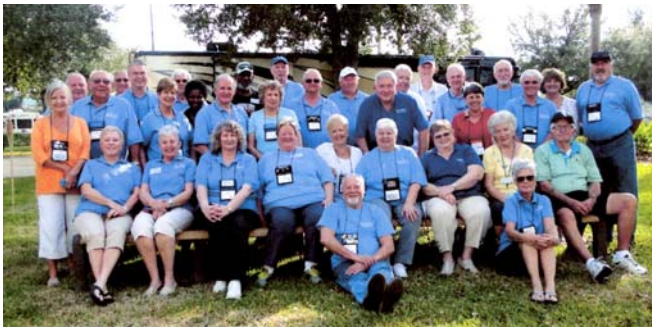
Blue Ridge Discoverys chapter came out in force!