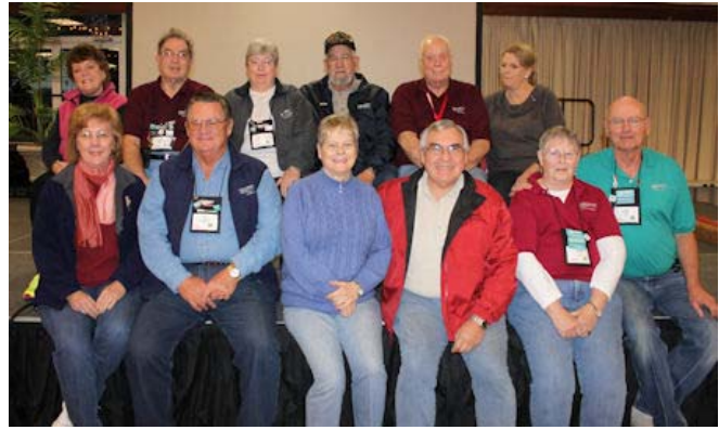
Texas Discovery Road Runners enjoyed the rally.