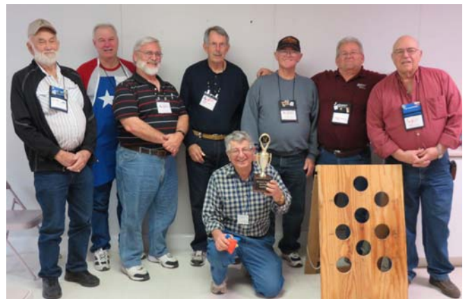
The triumphant Discovery Texans men!