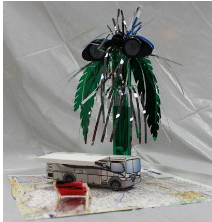
Lovetta Simpson created very clever centerpieces.