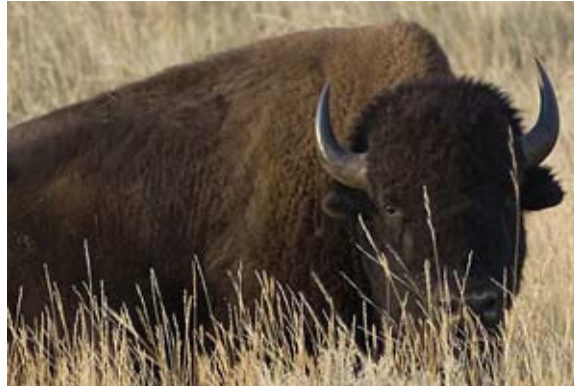
A buffalo grazes in the Gallatin national forest in southwest Montana

When taking photos, keep both of your eyes open. Why, you ask? If you have one eye closed when shooting, you are limiting your field of vision, and are therefore more likely to miss any action. Conversely, when you have both eyes open, you increase the chances of picking up on any action – and getting the perfect shot.