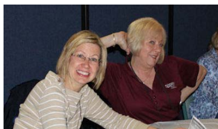
Some had fun posing!