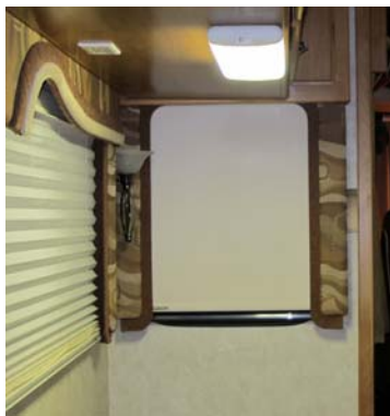
First shade mounted Thursday evening

On Thursday evening, February 20, Bob and I began preparing to have our 2005 39L's windows de-fogged the next day. He unscrewed the sofa and pulled it into the center of the room, and then removed the bookcase from the wall. The table followed, and then we put the under-sofa storage containers on the seats. He removed the valance from a small side window and removed the old shade unit, and then installed the first of the seven shade units we had received from MCD Innovations earlier in the week. We were pleasantly surprised at how easy it was to remove the old shade and install the new unit. Within minutes of that action, he had the valance back up and we could stand back and appreciate the new look.