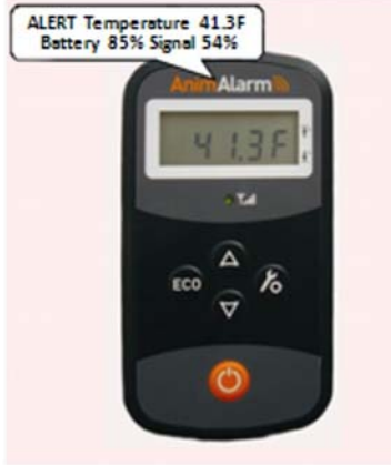
Temperature warning device for distance monitoring