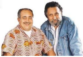
Tom and Ray Magliozzi