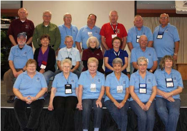
Mason-Dixon Discoverys had a whole lotta fun.