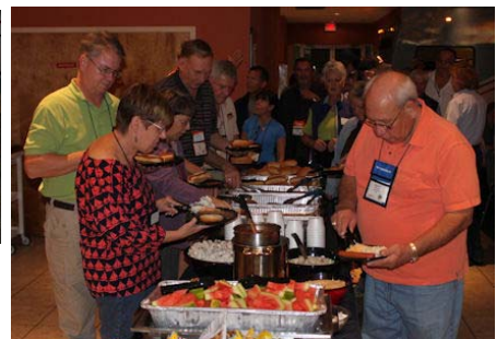
Good food was ample, and everyone was most satisfied.