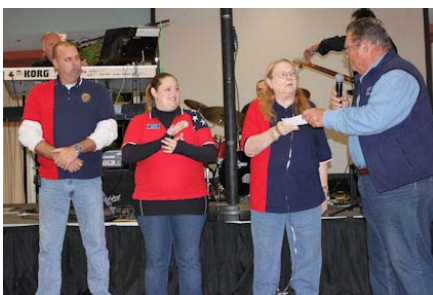
The American Legion benefitted!