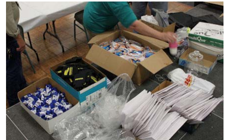
Just a "taste" of the many things that found their way into the goodie bags.