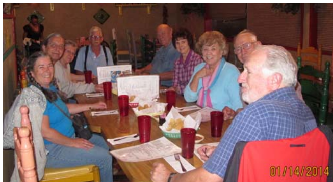
Northwest Adventurers at a restaurant (above) and the potluck on Saturday (top right).