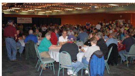
Happy hour first night was well attended.

The three photos above are of the very smart first-timers who attended the rally. I bet they will attend future DOAI rallies when possible.