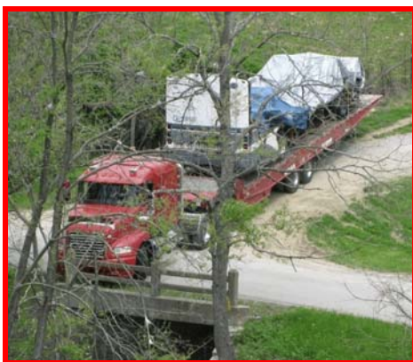
BigD in body bag; truck trying to turn around