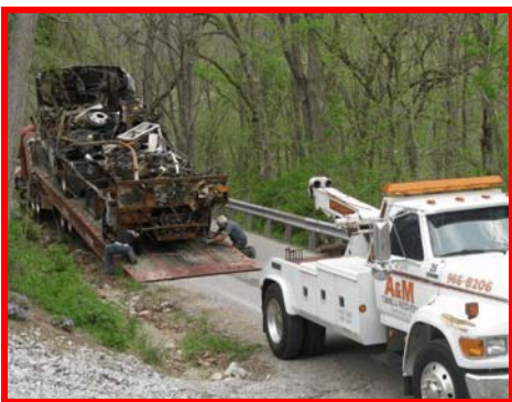
BigD on trailer and being secured