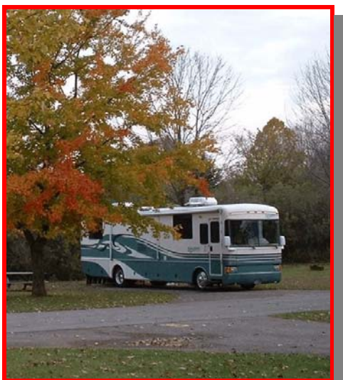
One last look at the BigD in far happier times