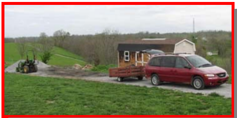
Last load of debris getting ready to go to the dump – 2200 pounds in all

Finally a neighbor in a pickup brought some kind of feed over and enticed the goats to leave the sanctuary of the trailer to feast on sweet goat treats. The flatbed driver took this opportunity to drive away and be rid of this place. ❖❖❖