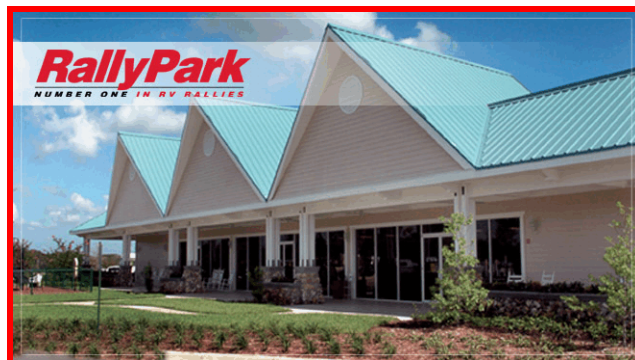
RallyPark's RallyCenter is a spacious place for meetings.