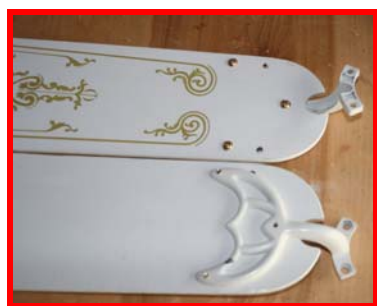
Blades shortened by re-drilling and changing the screw locations

Hint #1: Place the nozzle of the adhesive tube into the hole through the