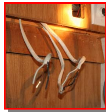
Heavy 10-gauge wire

ceiling and squeeze a liberal amount into the duct instead of dragging an adhesive mess through the duct as I did. I put some weight on each cord to hold them in contact with the foam duct and let the adhesive dry overnight. Hint #2: I could have used a couple of drill-pointed screws to hold them instead of waiting for the adhesive to dry.