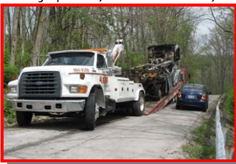
Truck pushing BigD onto trailer