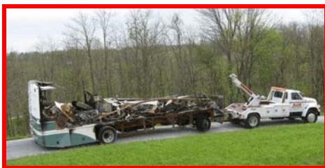
The BigD partway down the driveway

The insurance company sent out the third towing/salvage company. Another call and another tomorrow. After three tomorrows, they showed up and left without even getting out of their truck, never to return. ❖❖❖