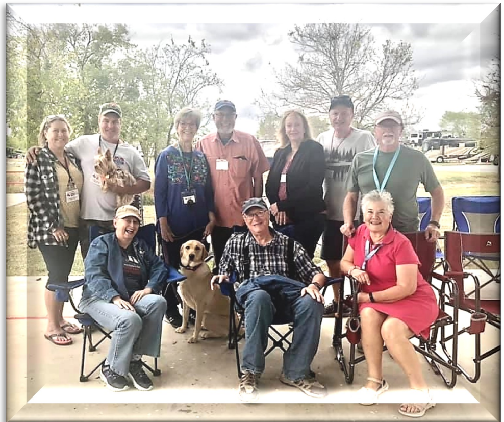
New Members, Discovery Texans