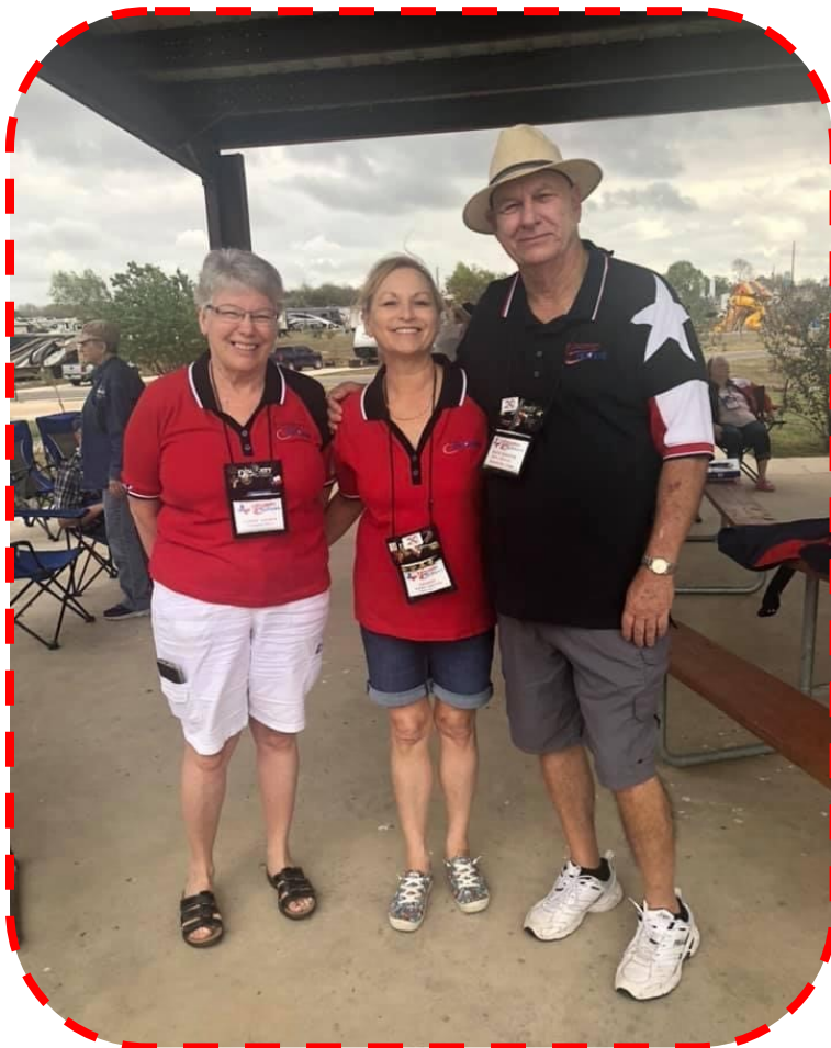
Discovery Texan Officers