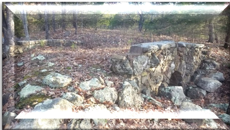
One of many stone culverts under the 17 mile old road built in 1933 that winds from I-49 down into the valley surrounded by the Boston Mountains