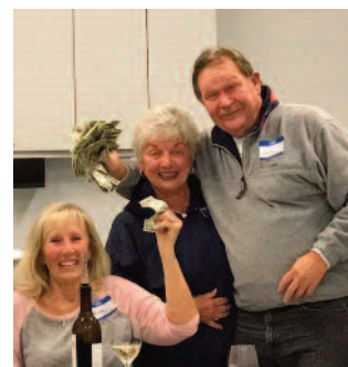
Happy Winners, Left Right Center Tournament