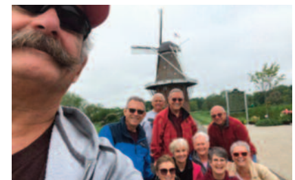
Everyone loves a windmill!