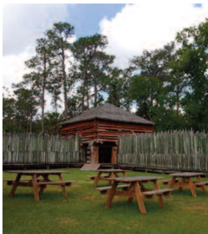
Fort Foster Hillsborough, FL