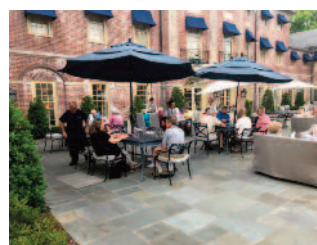
Dinner on the patio of the Williamsburg Inn