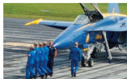
Blue Angels at the Sun N Fun Expo and Airshow, Perry, GA