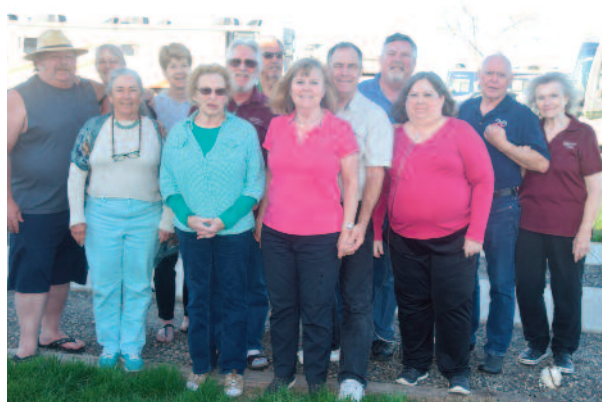
Prosser, WA Spring 2019 Rally Group Picture