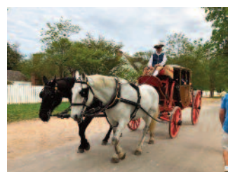
Carriage in Colonial Williamsburg.