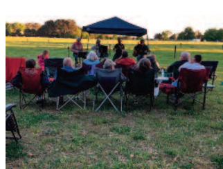
At the campground, enjoying our private live entertainment provided by The Route 5 Ramblers.