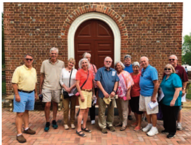
Prosser, WA Spring 2019 Rally Group picture. Some of our attendees that took the tour of Bruton Parrish, a historic Church in Colonial Williamsburg, are shown.