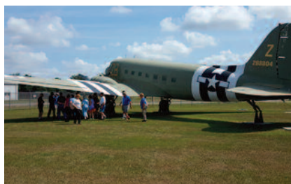
Zephyrhills Air Museum