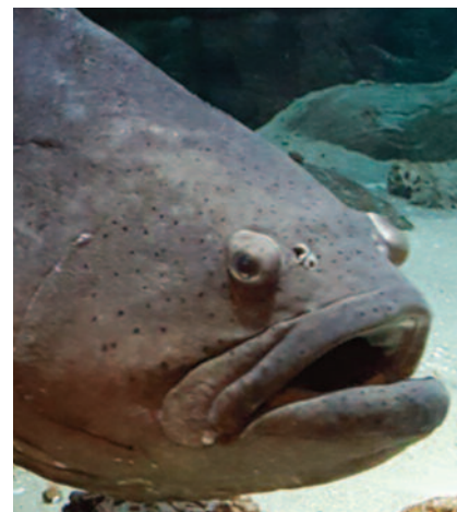
Florida Aquarium Exhibit