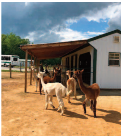
Touring the Alpaca Farm