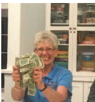
Happy Winners, Left Right Center Tournament