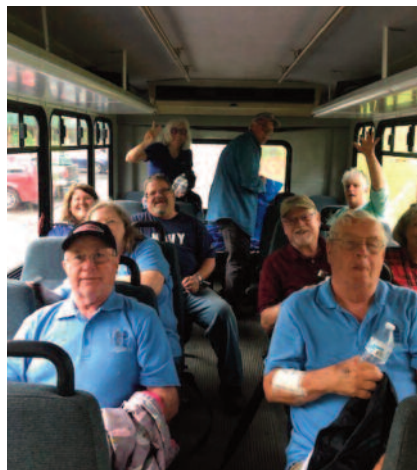
On the bus going to the Alpaca Farm in Williamsburg