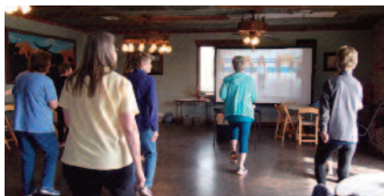
New Exercise Class Implemented