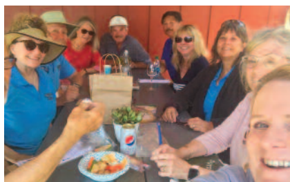
More wine tasting