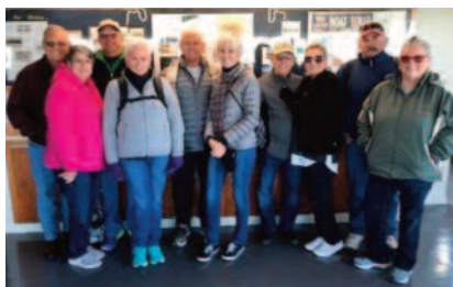
Lining up for a boat tour