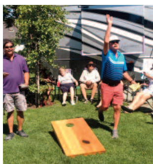
Stiff Competition at the Corn Hole Tournament