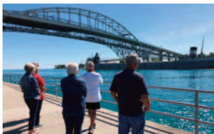
Mackinac Island, MI