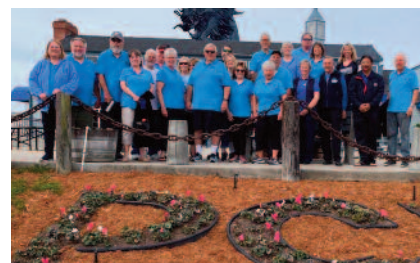
The Gang's All Here