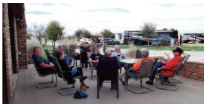
Social Hour at Coyote Ranch RV Resort