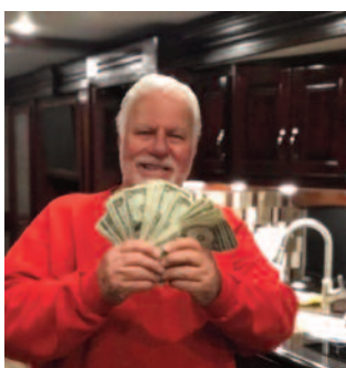
Happy Winners, Left Right Center Tournament