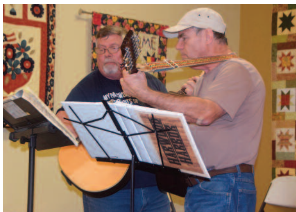
Discovery Sunshiners have Talent!