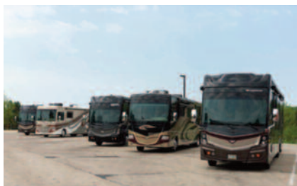
Ozark Discovery Ds in a line up