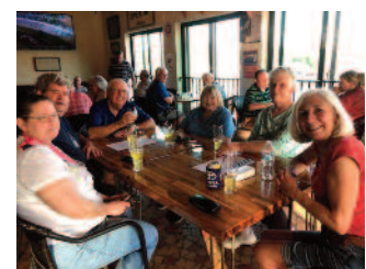
Enjoying a brewery in Jamestown, VA