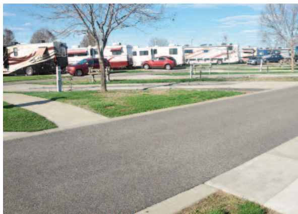
Prosser, WA Rally D's