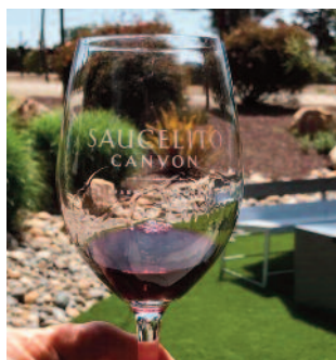
More wine tasting