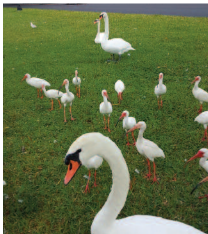
Free Range Swans at lake Morton, Perry GA

These were our last two rallies until November and December. Some of us plan to go to the FMCA in Minot, ND and then to Pueblo, Colorado for the National Rally. ❖