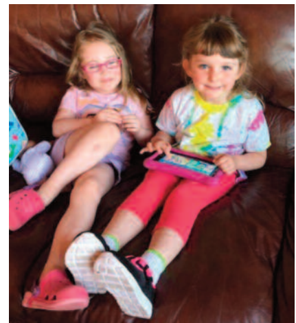
Our youngest guests