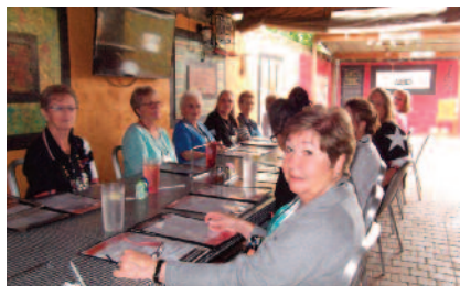
Ladies Luncheon - West Side Pizza, Fredericksburg, TX