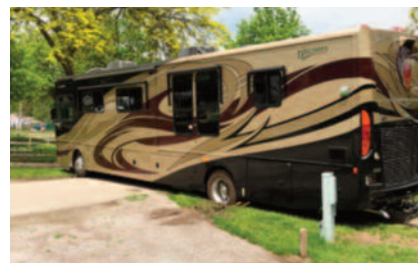
Oops! One got stuck in the grass. Ricky???