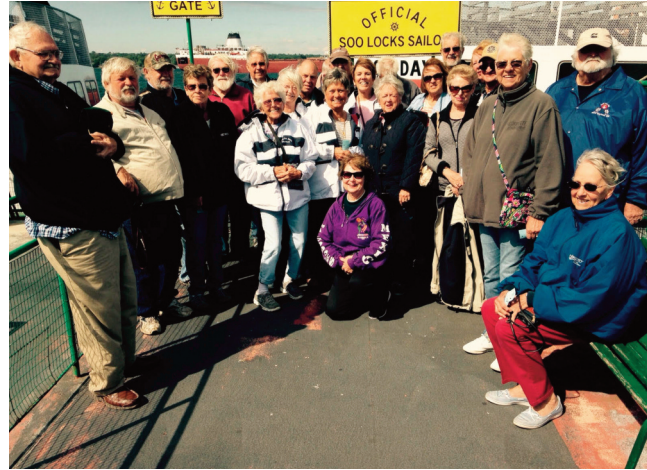
Members of the Midwest chapter enjoying themselves at the SOO Locks during their group rally in June.