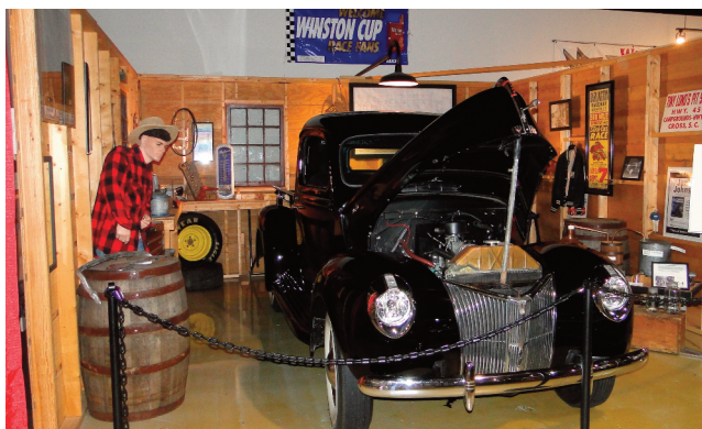
The start of NASCAR. The moonshine truck carried the moonshine made in the still.

“We had many good times and we took advantage of the many attractions in the area”.