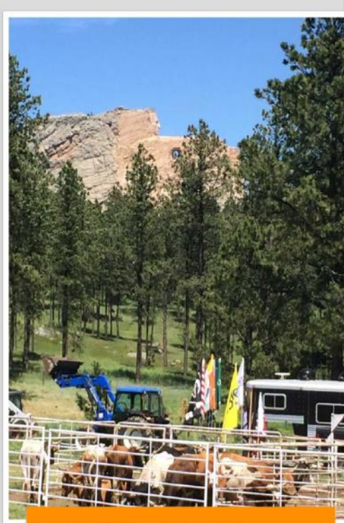
Emmit feeding a Would that be a Mule??