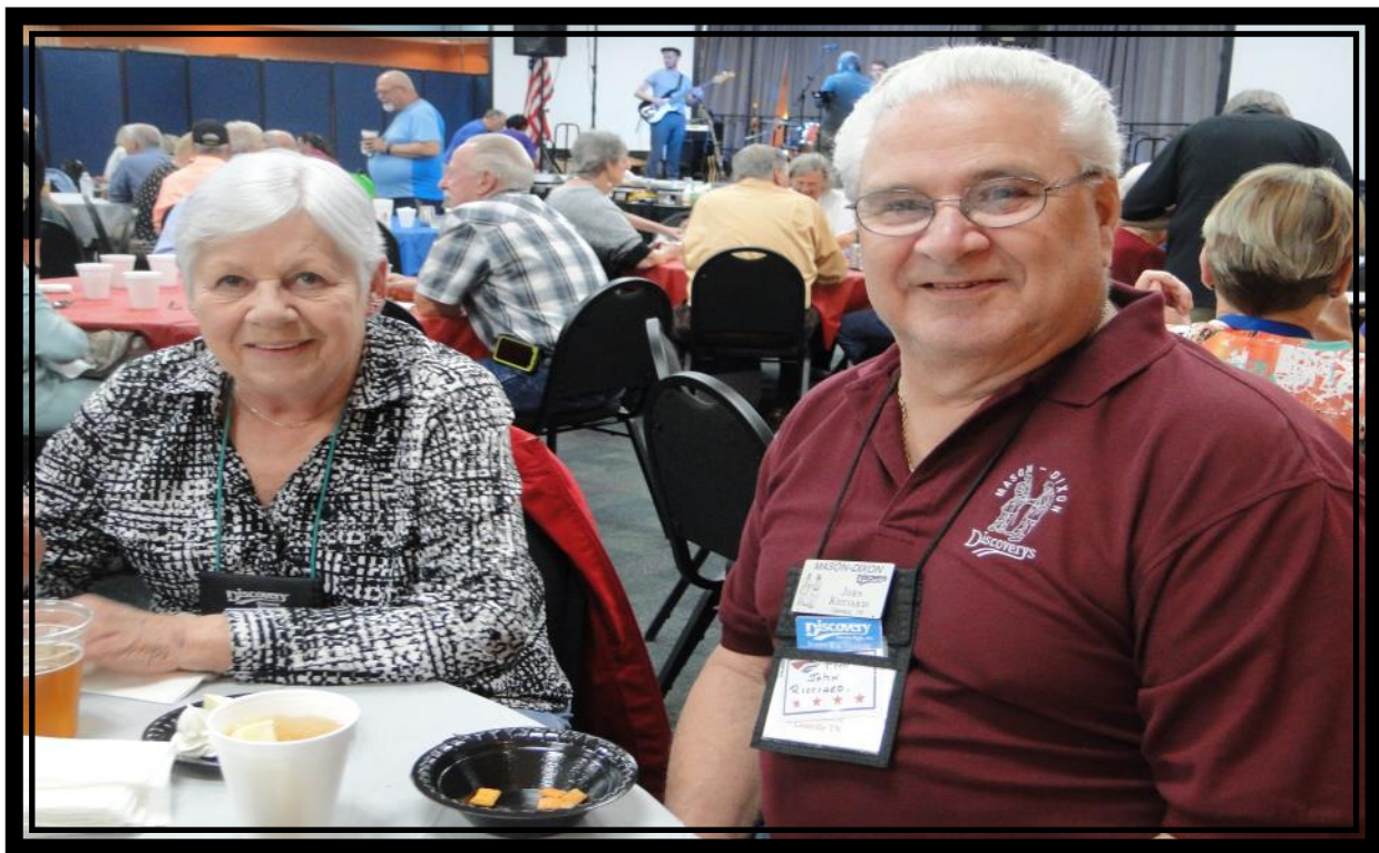
FMA, 27 Jan 2018, Seffner, FL