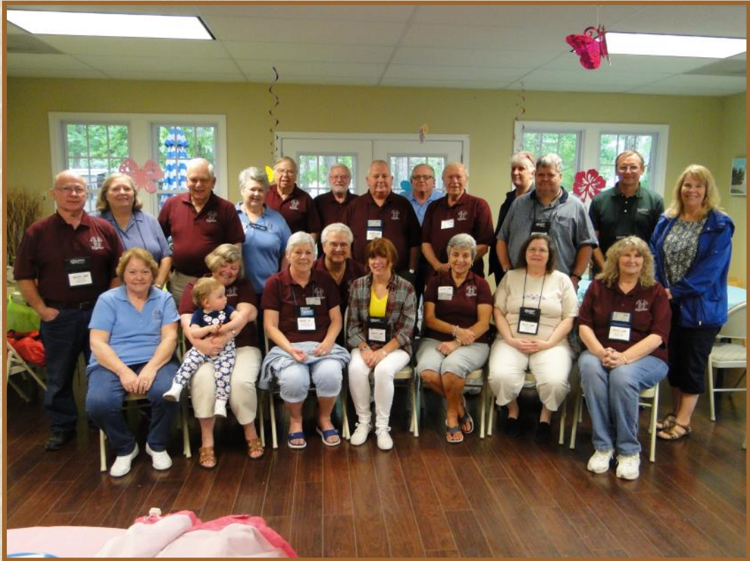
Mason Dixon Rally, Ashland, Virginia