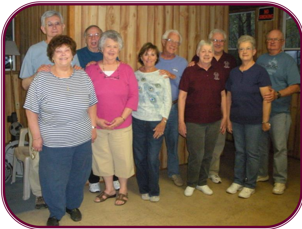
DOAI National Rally, Bethpage, Virginia 6 April 2013