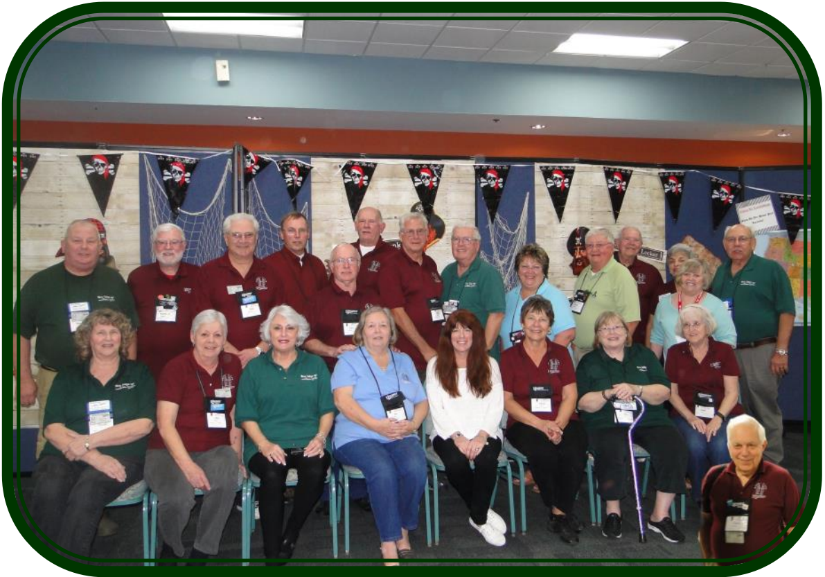
FMA-DOAI Seffner, Florida 29 Jan 2016