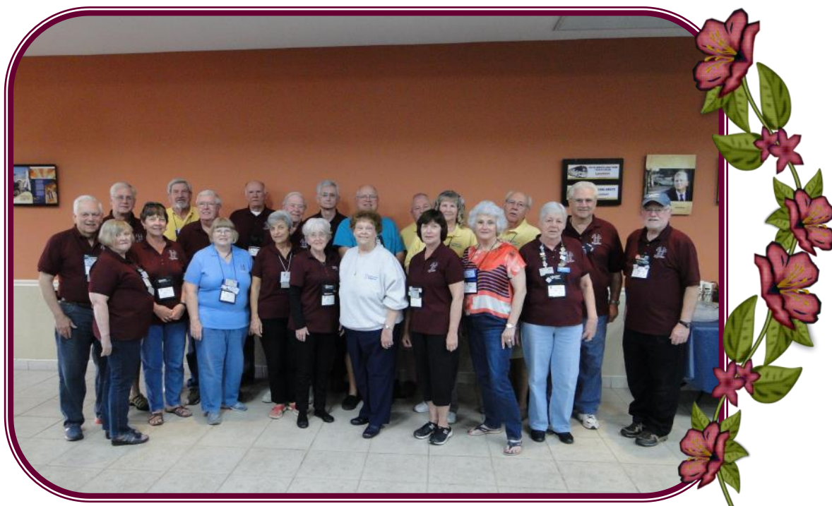
Southeast Region Rally, Seffner, Florida 29 Jan 2015